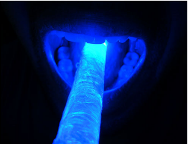
FIG. 1. New blue light-emitting diode (LED) device for photodynamic therapy (PDT) in the oral cavity.